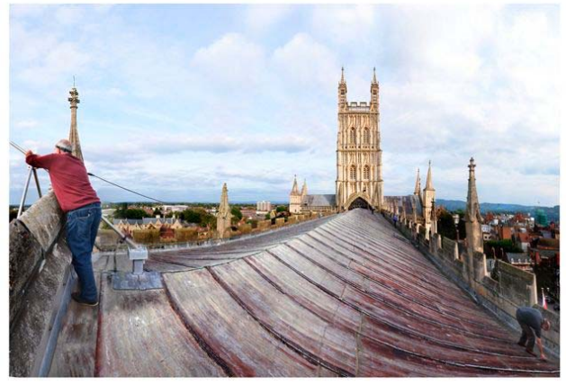
Fiddler on the roof or Alan G4MGW